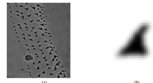
Figure 1: (a) Denticles on the ventral epidermis of a Drosophila embrio. (b) A denticle template.

studying the shapes and arrangement of the dark, saillike shapes that are called denticles. A simple idea for writing an algorithm to find the denticles automatically is to create a template T, that is, an image of a typical denticle. Figure 1(b) shows a possible template, which was obtained by blurring (more on blurring later) a detail out of another denticle image. One can then place the template at all possible positions (r, c) of the input image I and somehow measure the similarity between the template T and a window W(r, c) out of I, of the same shape and size as T. Places where the similarity is high are declared to be denticles, or at least image regions worthy of further analysis.