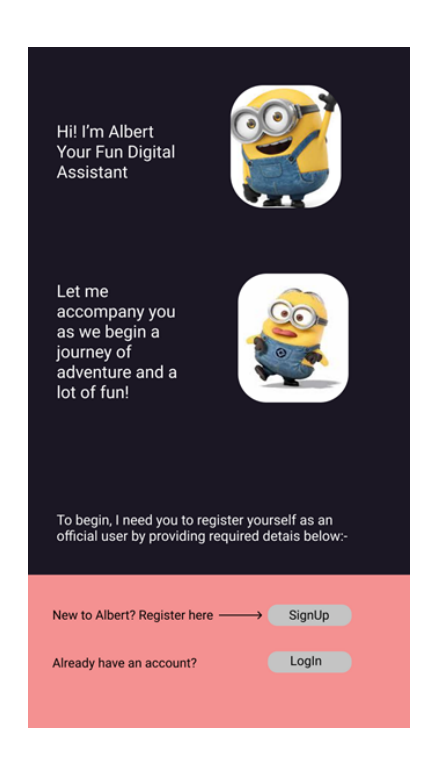
Figure 1 landing page

A basic prototype of some of the screens to be included I the application is given below.