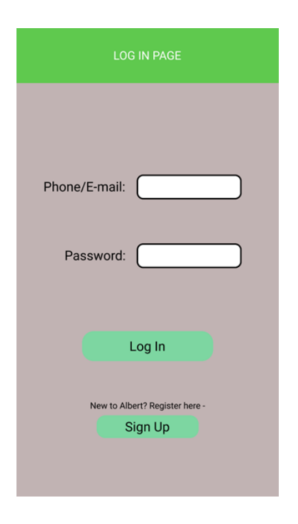
Figure 2log in page