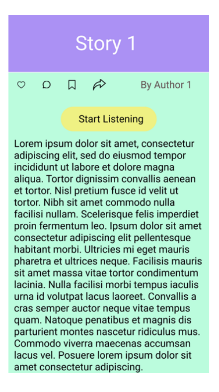
Figure 6 Read a story