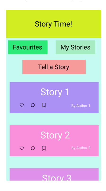
Figure 5 Stories home