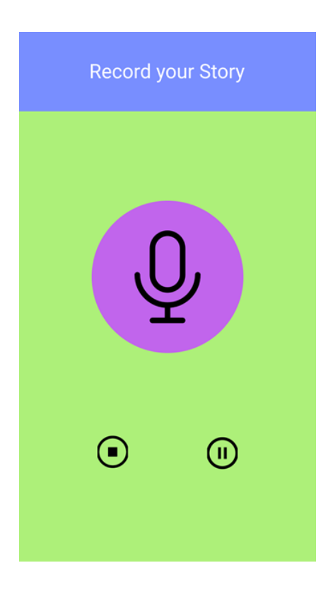
Figure 8 Record a story