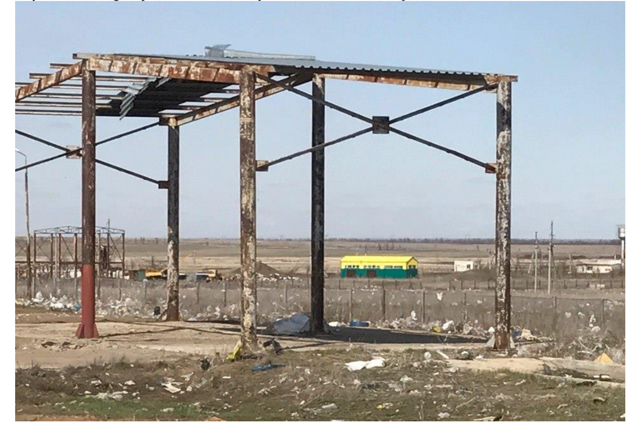
Picture 1-View of an unfinished waste processing plant at the landfill in Uralsk

In Uralsk, construction of a waste processing plant began, but due to lack of funds, construction was suspended, and only a waste sorting shop works on the territory of the landfill, where 300 jobs are involved.