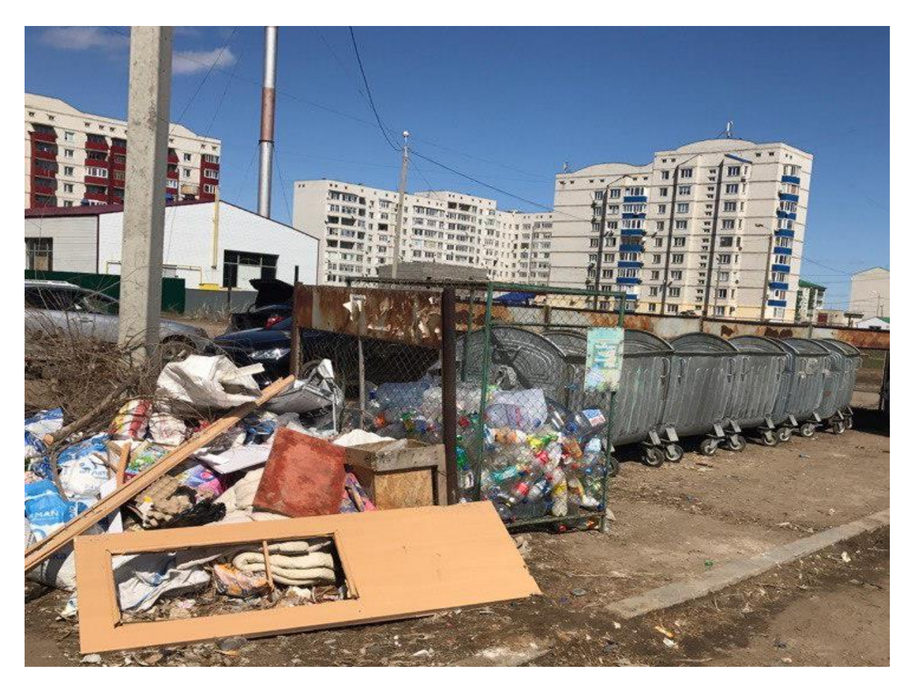
Picture 2 - The condition of the garbage containers in the city of Uralsk on the street of New Orda

As we can see, the containers are not marked with a color for separate garbage collection, garbage is taken out daily, but there are also elements of spontaneity, garbage is not always brought to the containers (picture 2).