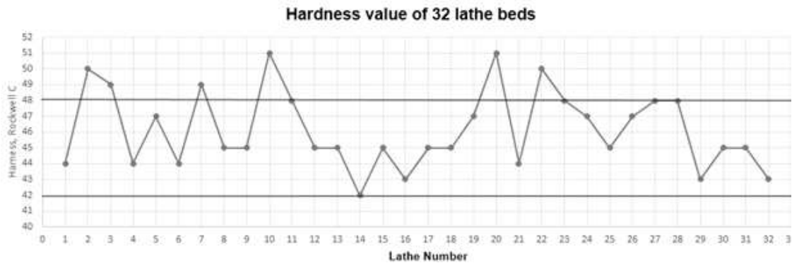
Figure 2: Run chart of hardness values