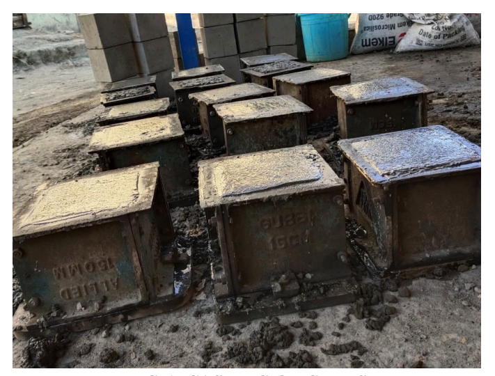
FIG-1: CASTING OF CUBES

The cubes are demolded after 1 day of casting and then kept in respective water for curing at room temperature the cubes are taken out from curing after 7, 14, & 28 days for testing. The demolished concrete has been collected from the Global Lab, NH 48, Golani Naka, Vasai East, Waliv, Maharashtra.