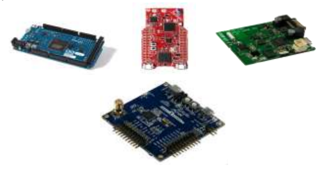
Fig. 1: Examples of low-end IoT devices.

We note that, lamentably, Moore's law isn't relied upon to help in this specific situation: it is foreseen that IoT gadgets will get littler, less expensive, and more vitality proficient, rather than giving fundamentally more memory or CPU power [14]. In this manner, within a reasonable time-frame, low-end IoT gadgets with a couple of kilobytes of memory, for example, Class 1 and Class 2 gadgets, are probably going to stay prevalent in the IoT.