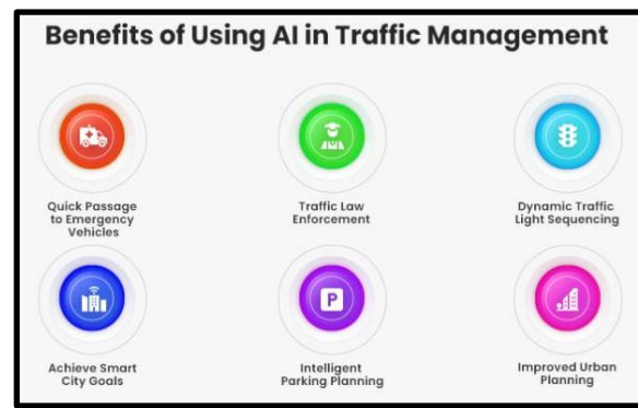
Fig 1. Significance of applying AI in traffic management

activities as well as the facilities and the disadvantages of this content based on this current era. The authorities from several industries can be able to know the effectiveness of this concept as per this recent era. For this reason, the outcome as well as the computed recommendations are quite sustainable for managing the traffic based on the criteria of the modern population base across the country.