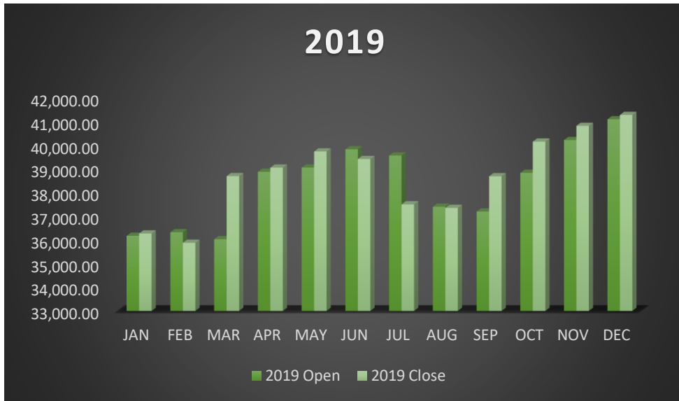
Graph No. 1

The graph explains that there was active trading prevalent as the investor’s investing strategies were not influenced by any negative factors like Covid-19. The market showed a 10.989% during the year.