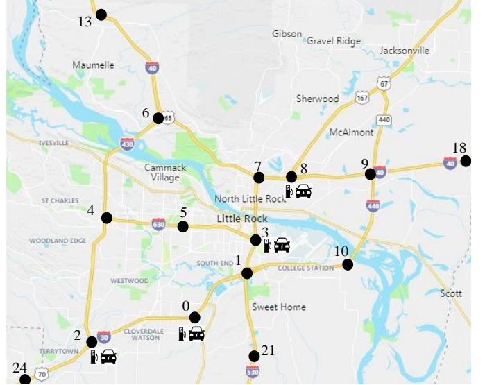
Fig. 2. Central Arkansas highway network.

As can be seen in Table II, the shortest path is (10, 9, 8, 7, 6), where the total travel time is 5.75 unit of time, the path reliability is 88.06% and the SOC at the end of the trip is 23%.