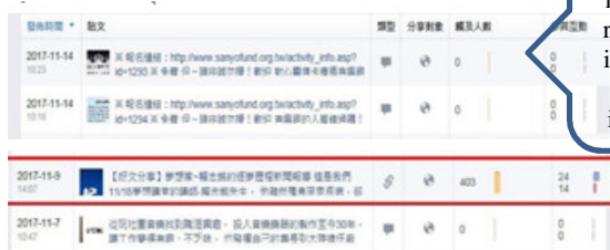
Figure 4. The post reach and interactions increase after sharing good articles

Compare before/after of sharing the event articles, the numbers of reaches and interactions are increasing.