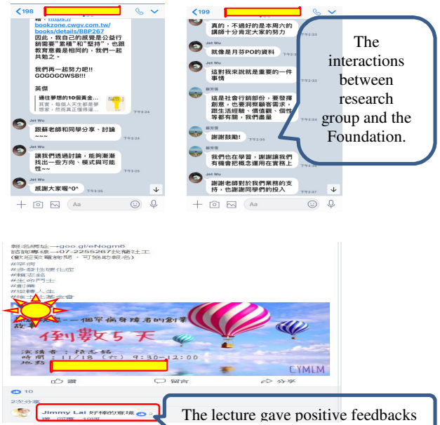
Figure 5. The Feedback of the Foundation Members

Figure 5 is part of the communication record between the researchers and the Foundation members, which indicates that the Foundation recognizes the effects of the marketing strategies.