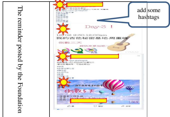
Figure 2. The Reminders of Activity Countdown in Words and Images

In Figure 2, the upper half of the reminder provides information in images and words while the lower half was posted on Facebook after the event venue, time description, and the hashtag were added to it.