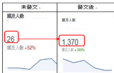
Figure 3. The post reach before and after the launch of the strategies

Most messages posted by the Foundation were registration information and the Foundation rarely interacted with fans. After the concepts of social marketing, the management of social media platforms and CRM were introduced and adopted, the Foundation succeeded in activating the fan page by sharing good articles and interacting with fans. Take the lecture of the patient with a rare disease for instance. The insight reports from Facebook, as shown in Figure 3 and 4, show that the strategies are effective, for the fans reached and the number of interactions both significantly rise after more images, audio data, and video data were posted on Facebook.