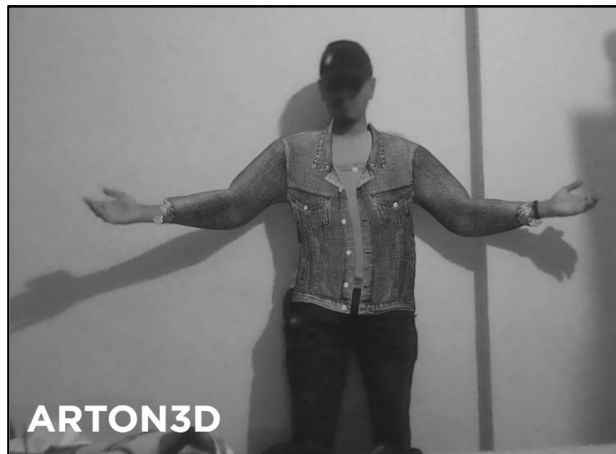
Fig.3: Denim jacket 3D try on (Front)