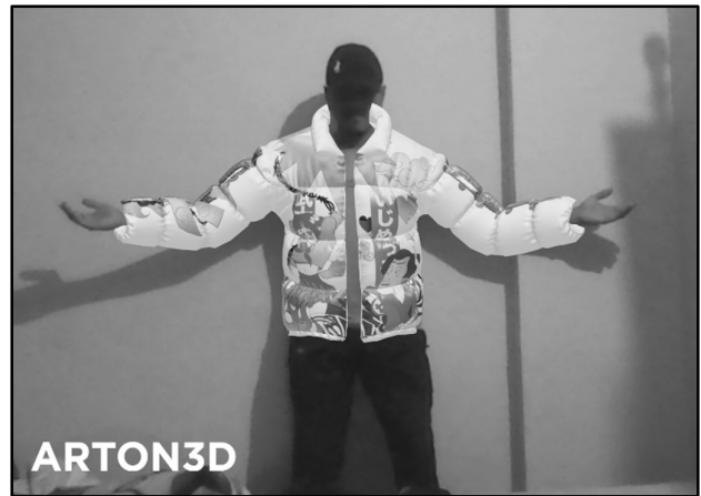
Fig.5: Puffer jacket 3D try on (Front)