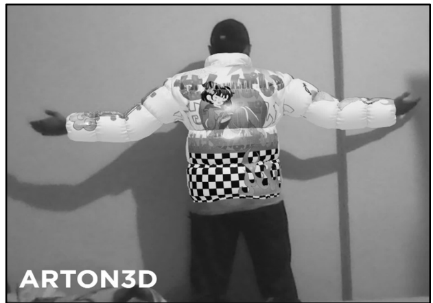
Fig.6: Puffer jacket 3D try on (Back)