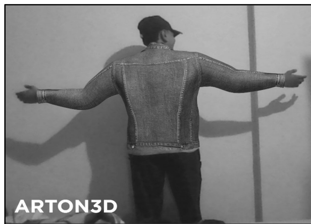
Fig.4: Denim jacket 3D try on (Back)