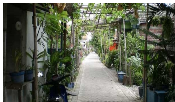
Figure 2: Urban Farming Activities in Surabaya