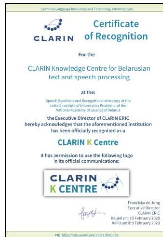
Figure 1. CLARIN Certificate of the Belarusian centre