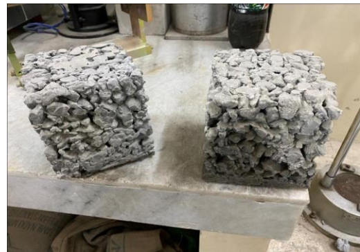
Fig. 1. Cubes of Pervious Concrete

This process was repeated for all the specimens.