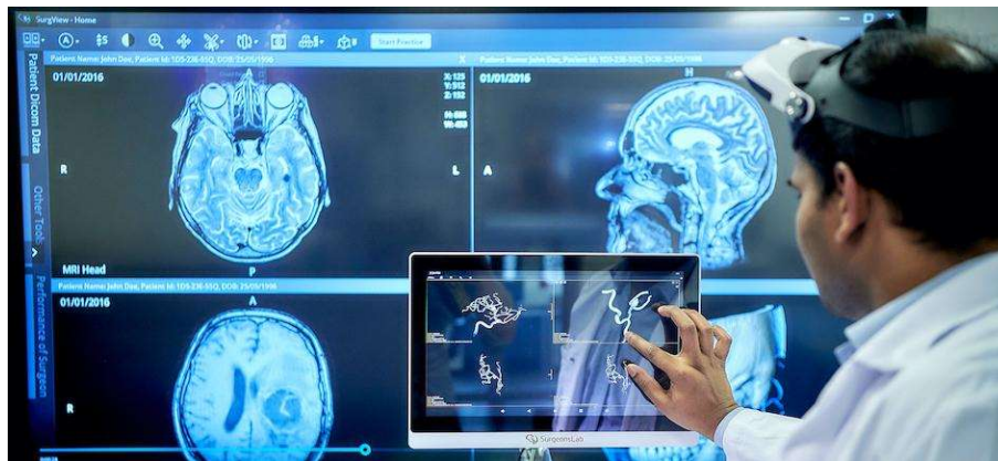
Figure 1 Remote patient monitoring devices

In addition to being fast, diagnoses with such systems are also accurate. In particular, artificial neural networks have shown that they are able to accurately detect certain diseases such as malignant melanoma.