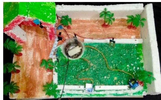
Figure 5: Our Designed Project Prototype (Top View)

Above figure illustrates the front view of our smart farm prototype, highlighting the arrangement of components in their designated positions.