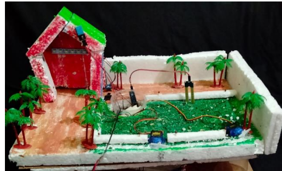
Figure 4: Our Designed Project Prototype (Front View)

application's interface has been thoughtfully designed to meet our system's requirements, emphasizing innovation, user-friendliness, and visual appeal.