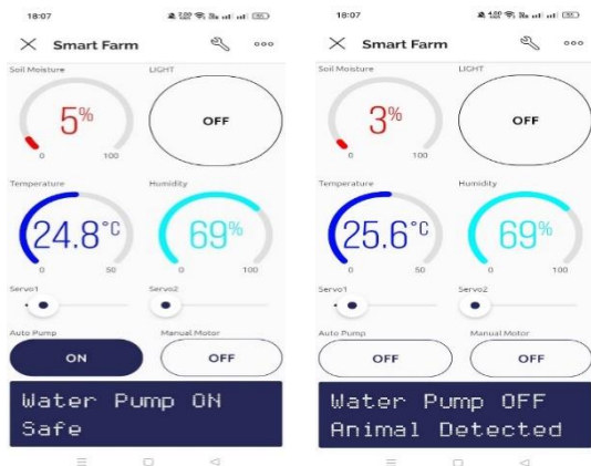
Figure 2: Our Designed App Interface

Additionally, a soil moisture sensor has been incorporated, with its probes inserted into the soil to measure moisture levels. The backend programming activates the water pumping system automatically when moisture falls below a predefined threshold, ensuring proper irrigation. This functionality is known as the automatic irrigation mode. Furthermore, we have implemented a manual irrigation mode, allowing manual control of the water pump based on specific