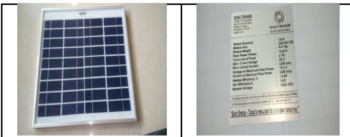
Fig.3 Solar panel front and back view

The maximum charging current from 20Watt solar panel is approximately 1.2A. This is also around 10% battery capacity.