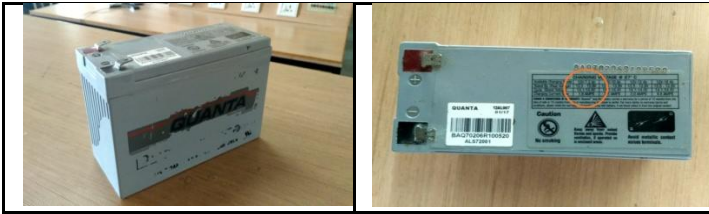
Fig.2 12volt, 12 Ah battery

To calculate the battery size we have to know the term depth of discharge (DOD). It is recommended to keep depth of discharge 50% (for lead acid battery) to increase the battery life. So, for calculation consider 120Watt-hour (Double than original calculation). If we assume battery 12V, 12Ah, then this battery watt-hour capacity is 12 * 12 = 144\text{Watt-hour} . This is acceptable.