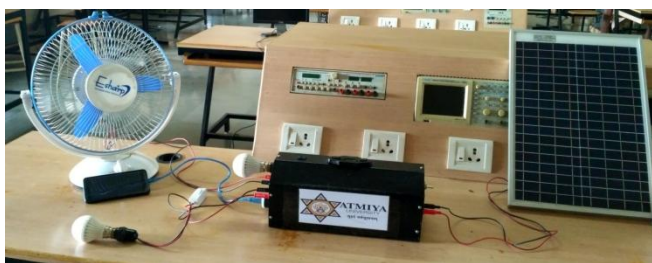
Fig.5 Minimum model developed on 12volt DC

Above system is working satisfactorily. It is designed to run for day and night without grid. Comparing above system with existing 230V, AC system following observations are found. Assuming 230V, AC fan with power consumption of 80Watt and running for 3 hours daily, one fan consumes 240Watt-hour energy. Similarly One AC CFL lamp of 18Watt running for 3 hours consumes 54Watt-hour. So, overall energy consumption will be around 134Watt-hour per day. If we use DC appliances it is found overall energy consumption will be around 60Watt-hour. So, almost more than 45-50% energy saving is found with DC appliances. So, while designing decentralized solar system for AC appliances it requires more than double size solar panel and double size battery for equal duration of usage.