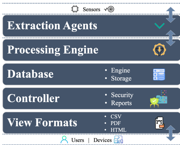
Fig. 3. AquApp's Platform Architecture

in a joint work for the management of access to air quality information and baseline for making timely decisions for the sustainable development of the district.