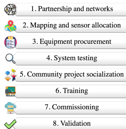
Fig. 1. Methodology of the project implementation

The paper is structured as follows and as Fig. 1 shows: Section II presents the design and implementation of our information system. Section III presents the design and implementation of our sustainable plan. Section IV shows the methodology to use. Finally, Section VI concludes the paper.