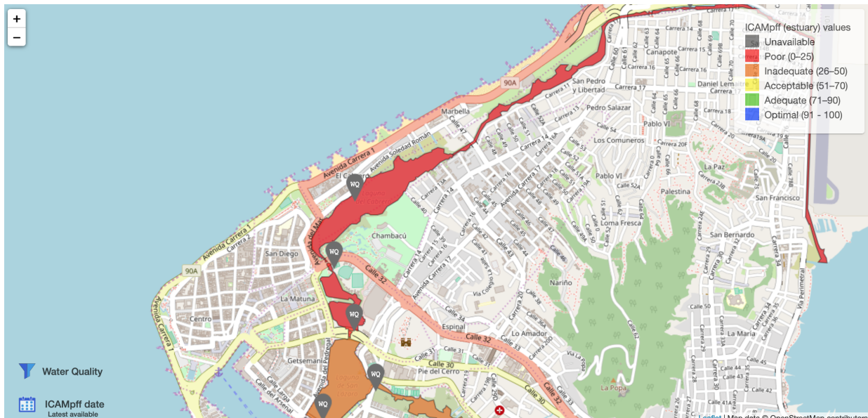
Fig. 2. AquApp user interface