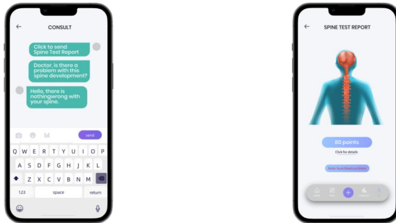
Figure 3: APP interface of the backpack part (a) Personal information (b) Usage time and weight (c) Consultation questions (d) Health report