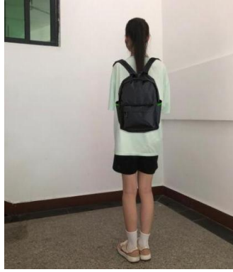
Figure 1: Product usage diagram