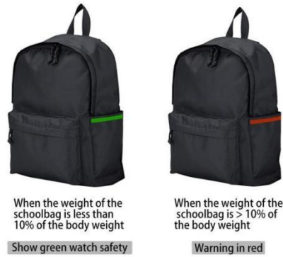
Figure 5: Backpack design b