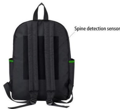
Figure 6: Backpack design c