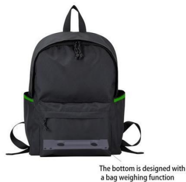
Figure 4: Backpack design a

In order to measure the weight of the schoolbag more accurately, we added a load cell at the bottom of the schoolbag. When you place the schoolbag on a stable surface when using the schoolbag, the backpack will weigh itself, as shown in Figure 4, and perform data processing operations. Then pass it to the APP software program. When the weight of the backpack exceeds 10% of the body weight, the schoolbag will issue a red warning, and the APP software program will also issue a warning, otherwise it will be green, as shown in Figure 5. A sensor is installed on the back of the backpack to detect compressive stress and tensile stress. The processor is used to compare the detection signals transmitted by the sensing mechanism to determine whether the human body has hunchback, scoliosis and other problems, as shown in Figure 6. If these irregularities are found When posture, the alarm will remind. The detected schoolbag weight and spinal health data will be transmitted to the APP software in real time. Parents can understand the health of children's spinal development through data analysis. The software will also provide relevant knowledge instructions such as precautions and preventive measures, as shown in Figure 4 and Figure 5.