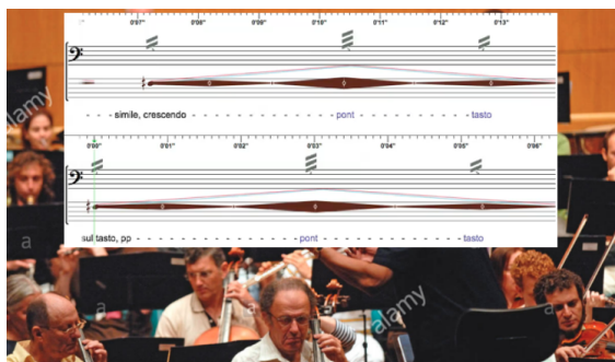
Figure 3. Score display from the performer's point of view.

According to the performers' feedback, head-mounted setups provide a large and comfortable display, since the environment is still visible around the score (see Figure 3), or through the score in the case of holographic display (such as the Aryzon headset for instance). The performers also showed interest in their ability to move freely on stage or elsewhere (the piece was choreographed differently according to the venue: in a church, the flute and clarinet started the piece behind the audience and gradually approached the altar), which relates to the term phygital (physical+digital) coined by Fabrizio Lamberti [27], who claims that with AR and VR, the possibilities of physicalization of gaming will soon encompass other fields.