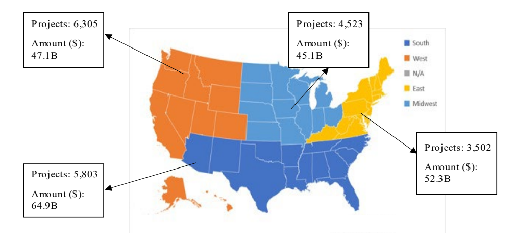
Figure 2. Map Summary of Total Number of Approved Projects and Funding from Infrastructure Investments and Jobs Act

approved funds; $2.8 billion is allocated for broadband, $10billion for clean energy, and $2.5 billion was allocated for EVs, buses and ferries. Approximately $115 billion was allocated for the roads, bridges and other mega projects. The aggregated data demonstrated that total number of projects available for Eastern US is 3502 projects with funding of $52.3 billion Dollar, US Southern Region receives 5803 projects with 64.9 billion USD, West receives 6305 projects with 47.1 billion USD, and Midwestern Region is granted 4523 projects with funding totaling up to 45.1 billion USD. The summary of approved projects from IIJA is represented in Figure 2.