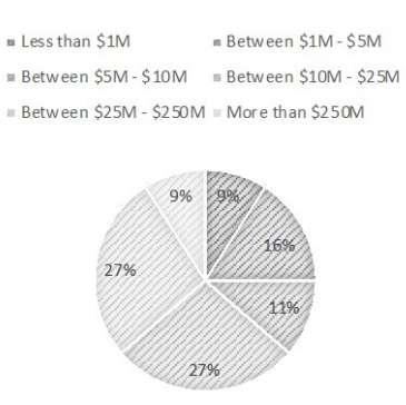
Figure 3. Electrical Contractors' Annual Revenue Categorized by the Size of Revenue

Out of 54 responders, the specific regions where the responders are from are as follows: 5 from Eastern US; 12 from Midwest; 15 from Western US, and 12 from mixed operation. As much as the contractor's origin differs, so does the revenue size. Approximately 9% of electrical contractors raised less than $1M; 16% replied as between $1M to $5M; 11% responded between 5M to 10M; 27% generated between 10M to 25M revenue; 25M to 250M 27%; and only 9% of the survey participants responded as raising more than 250M as a revenue.