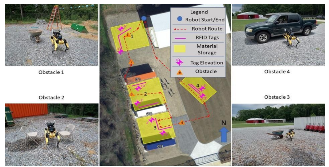
Figure 2. Experiment Layout

completion of the training run, the RFID payload was turned on and wirelessly connected to a laptop to record all read tags during each run. The RFID payload uses a terminal emulator (PuTTY) to wireless send the tag reads to a user interface in real-time. The robot traveled the predetermined route with the active payload, gathering RFID tag IDs. The experiment was run ten times under training run site conditions and ten more times with obstacles placed in the robot's path. Readings were logged and exported as *.txt files after the experiment, then loaded into an Excel spreadsheet for processing and noting any missed tags and probable in situ factors impacting readability.