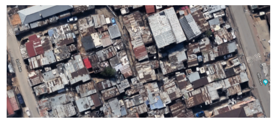
Illustration 2: Alexandra Township