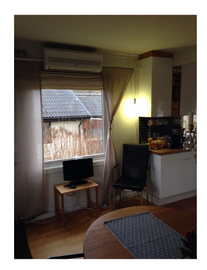
Figure 2: First prototype near the kitchen in the dining room

The first prototype was used without problems for four days with no data corruption. After interviewing the family as a group, the following responses were derived for each principle from Mankoff (2003):