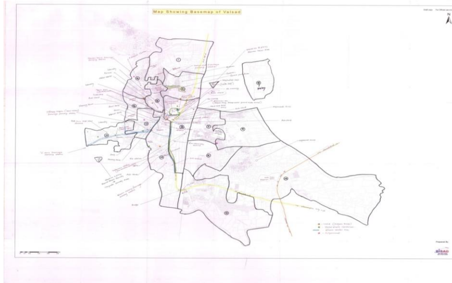
Fig1 Ward wise map of study area

population is 145592 persons and households is 44434. See here below figure no. 2 in which since 1951, decade wise population mentioned. As per official records there has been found that the rapid growth of population was high migration and natural growth. Valsad city differentiates in 14 wards. In valsad summer, climate has a hot and humid and winter climate has cold and dry. During monsoon an average rainfall is 2160 mm.