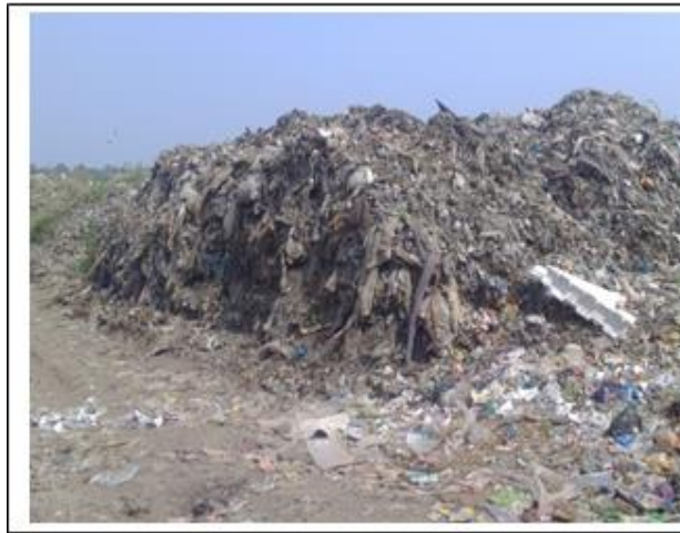
Figure 3 Location of open dumping site near the Oranga river bank

Where the secondary segregation is done and separate out recycled and reuse waste (toys, plastic bottle) by rag picker and selling recycles waste to scrapper in 2Rs/kg and earning money. Open dumping site no scientific care is taking of the site nuisance of insects, flies and leached is found at the dumping site. Area near the dumping site has bad odour and unwanted site. Due to unscientific disposal causes an adverse impact surrounding environment and human health. There are 44 large bins placed in entire town at different location at residential and commercial and institutional area. Such a factor like eating habits, measures of quality of life, degree of commercial activities and seasons affected the amount of MSW production (Salunke et al., 2016; Arti, 2015; Swapan et al., 2013).