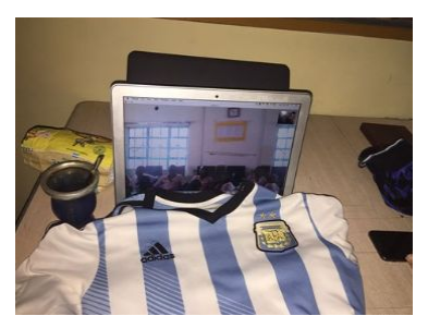
Figure 6: Argentine students sharing their culture with Kakuma Refugees.