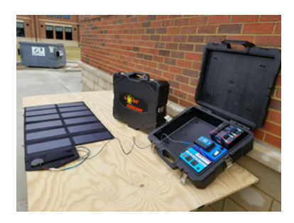
Figure 2: The Solar Suitcase was developed by Koen Timmers and Brian Copes.

In the camp one of the biggest challenges was power issues. This make it impossible to have a Skype call with students from different parts of the world. A sustainable solution to provide solar power was implemented.