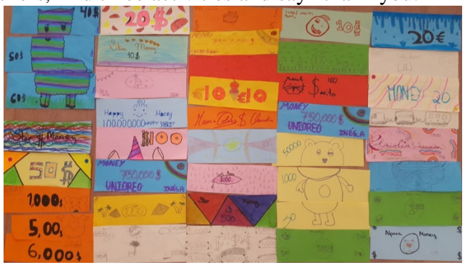
Image 3. Sample – Thank You Coupons, designed by the 6th Graders in the American School of Las Palmas, Spain. The picture shows how creative were the individual "artists". The reason for saying thank you is written on the back side of each "banknote", this way it remains always there, a nice memory from each other.

This module provides an opportunity to learn monitoring and better-expressing emotions. The Coupon itself is designed individually, and any creative self-expression is welcomed. The value does not count; the only rule is to name three classmates or teachers, find three activities and say "thank you."