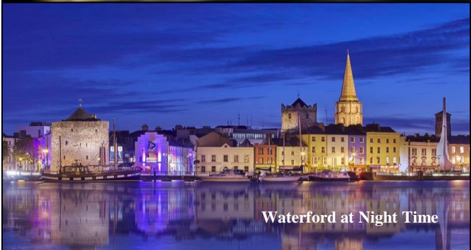
Waterford at Night Time