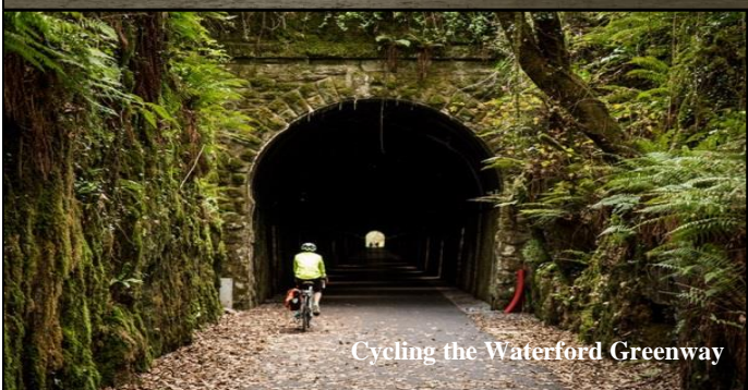
Cycling the Waterford Greenway