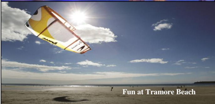
Fun at Tramore Beach