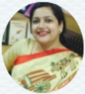
Dr. Umang Singh Institute of Technology & Science Ghaziabad, India