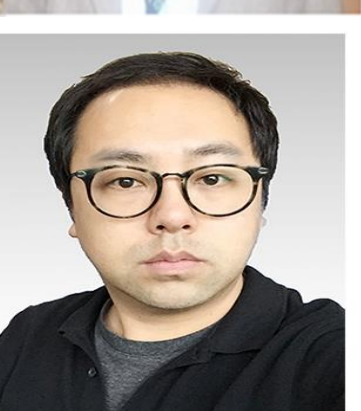
Human-Centered AI Applications