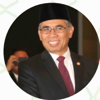
* Wimboh Santoso, Ph.D Chief of Commissioner of OJK Chairman of MES, Indonesia