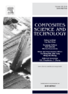
Composites Science and Technology