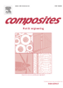
Composites Part B: Engineering